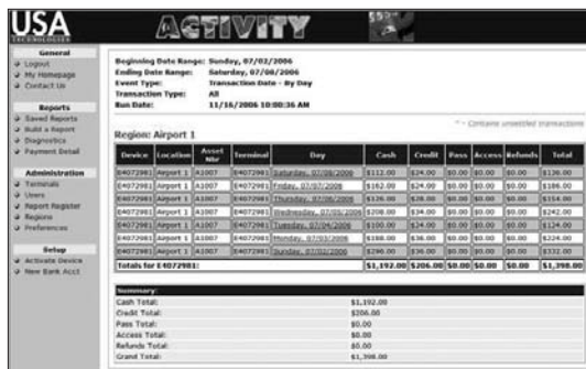
Figure 2. Transaction Reporting Cash and Cashless