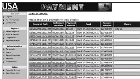
Figure 3. Settlement, Driver Accountability, and Audit

Eaton Corporation Electrical Sector 1111 Superior Ave. Cleveland, OH 44114 United States 877-ETN-CARE (877-386-2273) Eaton.com